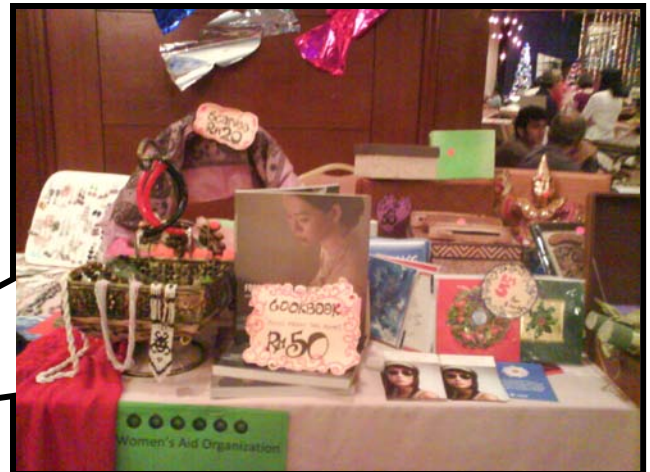
Just a few of the many unique knick-knacks on sale at WAO's booth at the ABWM Charity Bazaar

There's always something for everyone at WAO's jumble sales—whether you're looking for tableware or toys. Join us at our next jumble sale, on the 4 th and 5 th of April 2009 at Amcorp Mall.