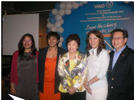
The event was officially launched by Dato' Dr. Ng Yen Yen, Minister of Women, Family and Community Development.