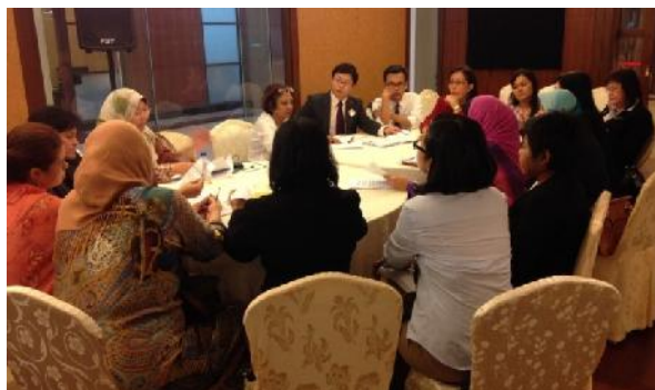
JAG members discussing proposed law amendments with the Women's Parliamentary Caucus