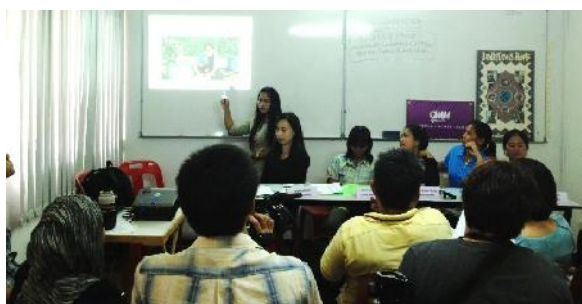
Penan women activists present at a press conference

WAO was a member of the 2009 National Task Force Committee to Investigate into Allegations of Sexual Abuse against Penan Women (the Task Force) in Sarawak, set up by the Ministry of Women, Family and Community Development (MWFCD). In June 2013, WAO hosted five Penan women who had travelled to Klang Valley to urge