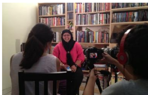
During the production of the video

In the run up to the 13 th general elections, JAG produced a video to persuade Malaysians, particularly women who otherwise may not vote, to vote.