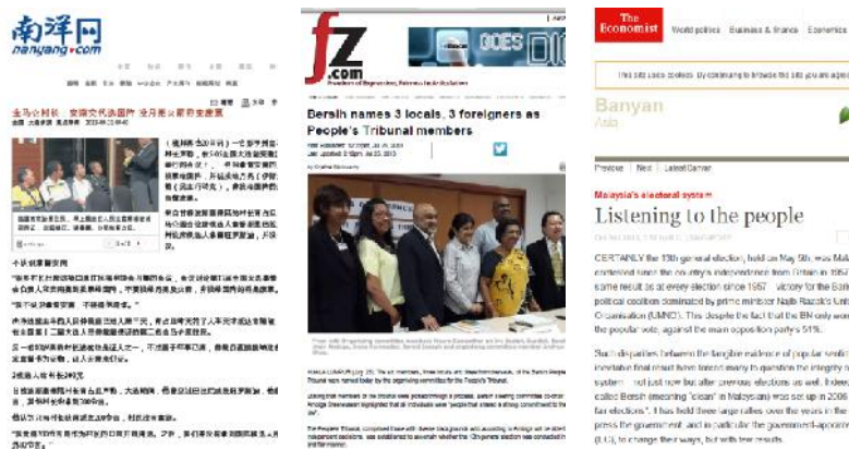
Screenshot of news coverage of the Tribunal

Amongst others, WAO assisted to co-ordinate the logistic and administrative arrangements for the Tribunal, media and publicity, production of the information booklet and oversaw the production of a video documentary. WAO will continue working on preparing for the delivery of the findings by the panel members, which is expected to take place at the end of March 2014.