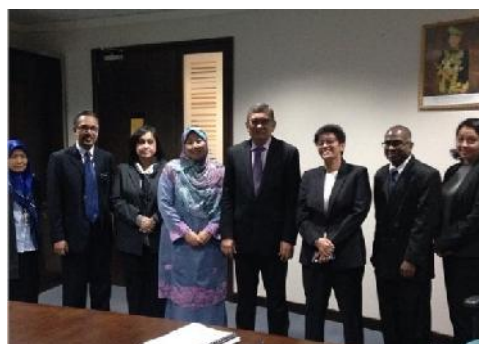
JAG and the Women's Parliamentary Caucus after briefing the Attorney General