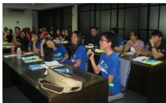
Students participating in the Choose2Protect talks

Understanding power relations within a relationship helps negotiate one's role in it. We strongly believe that because of the basic fact that whoever controls and has power within a relationship, also controls the sexual relations. This intersects and strongly determines abuse within a relationship.