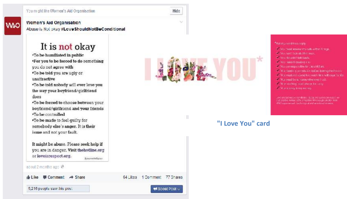
"I Love You" card

The 16 Days of Activism Against Gender Violence was a major campaign that was organised using social media. The theme for the 2013 campaign was Love Should Not Be Conditional . Below are some snippets from the campaign.