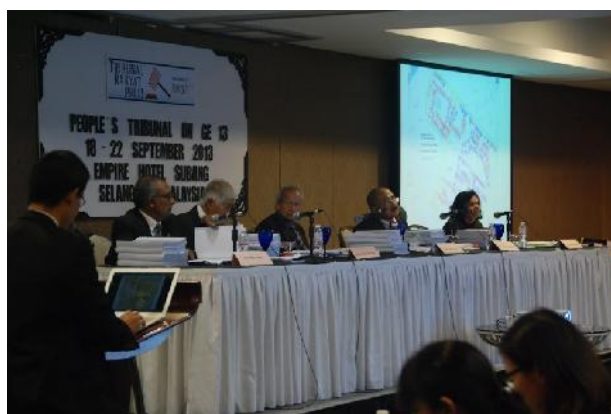
A witness giving testimony at the People's Tribunal on the 13th General Election

WAO continued to support BERSIH 2.0, the Coalition for Clean and Fair Elections. In 2013, WAO's Executive Director and a WAO Executive Committee Member was part of the Organising Committee for the People's Tribunal on Malaysia's 13 th General Elections. The People's Tribunal was mooted in response to the public outcry and concerns of electoral fraud and irregularities in GE13. As an avenue for the Rakyat to make their voices heard, the People's Tribunal provided a platform for evidence to be presented and scrutinised.