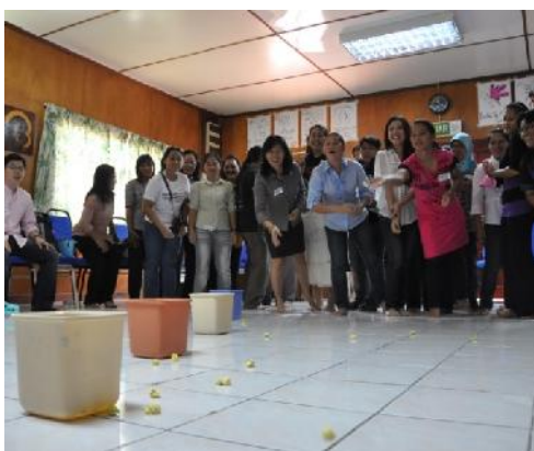
Women activists from Sabah and Sarawak participating in a workshop on UN and ASEAN human rights mechanisms

Human rights institutions in the Association of Southeast Asian Nations (ASEAN) are relatively new. ASEAN commissions and declarations have been introduced in the past few years, and will continue to be developed in the coming years. As such, effective engagement by civil society at the ASEAN level is vital to ensure that ASEAN human rights mechanisms match international human rights standards as close as possible.