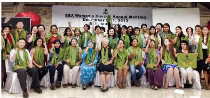
Women's rights activist from across Southeast Asia participate in the Women's Caucus annual meeting in Bangkok

The Women's Caucus sent formal letters and memoranda to the ASEAN Commission on the Promotion and Protection of the Rights of Women and Children (ACWC), the primary drafters of the Declaration.