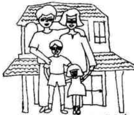
BACK TO HUSBAND - 47.1%

During their stay at the refuge centre, the women discuss their problems with our social worker volunteers and other women at the centre. We only provide them with options and possible solutions; the final decision is theirs. During 1990 almost half the women went back to their husbands (compared to about a third in 1989). 19 percent went to live with their parents, close relatives or friends, while 29.4 percent found jobs and lived independently.