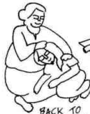
BACK TO RELATIVES/PARENTS/FRIENDS - 19.1%